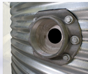
Waterplex Flanged bolted 1 50mm water tank outlet fitting with 80mm orifice plate.